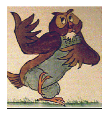
The Frontenac Times Advice Column

Official Mascot of the College: Minerva, the Owl of Knowledge <u>Unofficial Mascot of TCSC 01</u>: Fighting (the) Cock, the rooster of rational professionalism.