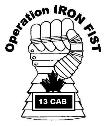
Beware the fist.

The typical staff officer is the man past middle life, spare, unwrinkled, intelligent, cold, passive, non-committal; with eyes like a cod-fish, polite in contact but at the same time unresponsive, cool, calm and as damnably composed as a concrete post or a plaster-of-Paris cast; a human petrifaction with a heart of feldspar and without charm or the friendly germ; minus bowels, passion or a sense of humour. Happily they never reproduce and all of them finally go to hell. - Anonymous