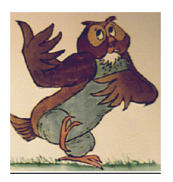
The Frontenac Times Advice Column