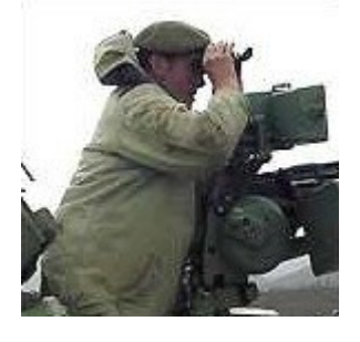
Oh, man, that plan is going for a shit. COS, send in 13 CAB.

The cameras that seemed to be everywhere, each vying for my photo, astounded me! I thought back to my days at the staff college . . . what would my directing staff would have done in this situation? Here I was faced by a moral dilemma, or was it a situation? Should I credit the staff for their efforts, the soldiers for their blood, sweat, and tears (not that my soldiers cried)? I stepped up to the scrum of reporters and told them . . . It was all thanks to <u>my</u> master plan.